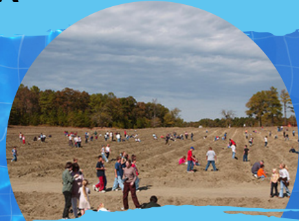
Crater of Diamonds