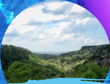
Petit Jean Mountain