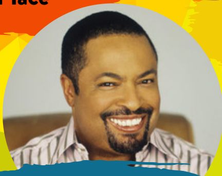
E. Lynn Harris