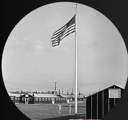
Jerome Relocation Center