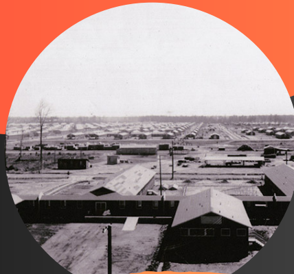
Rohwer Relocation Center