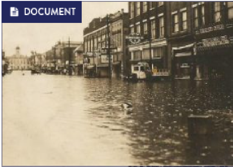
Pine Bluff Flood