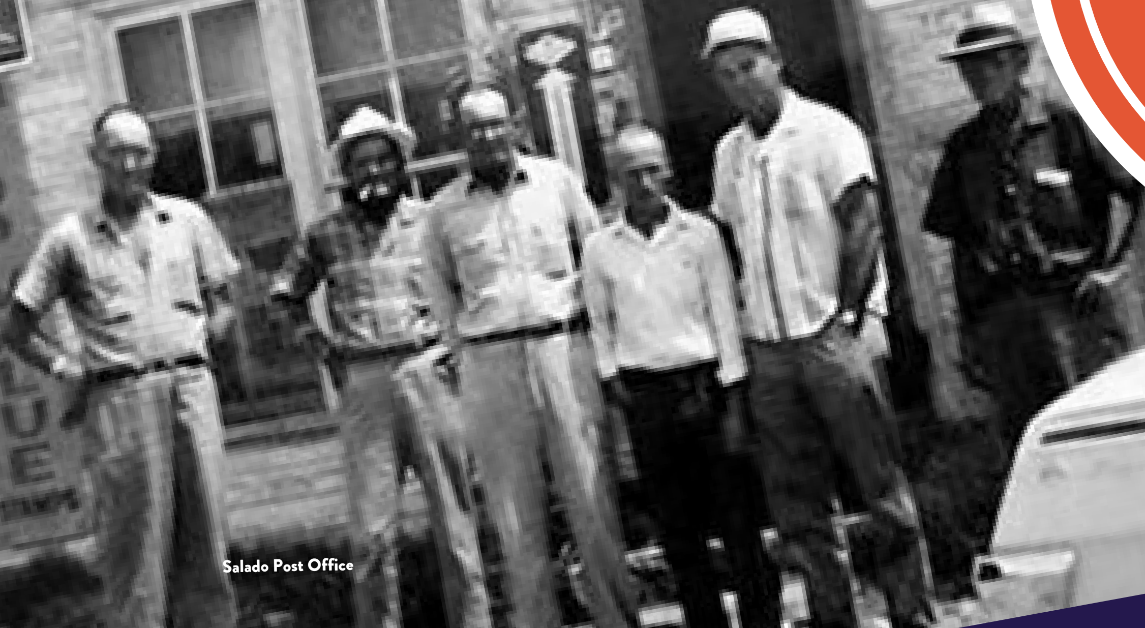
Salado Post Office