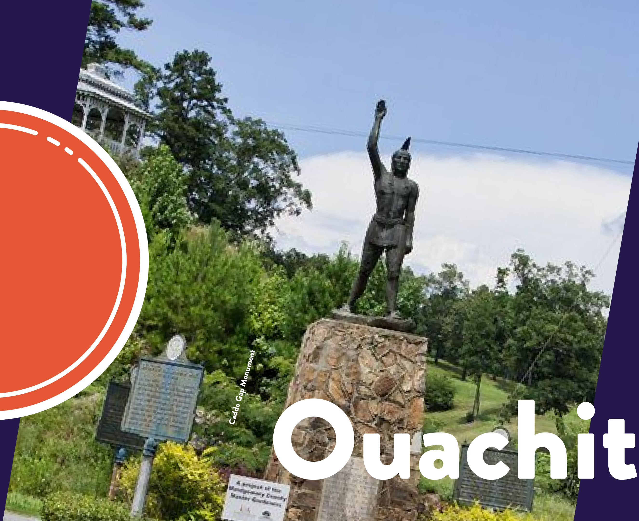
Caddo Gap Monument