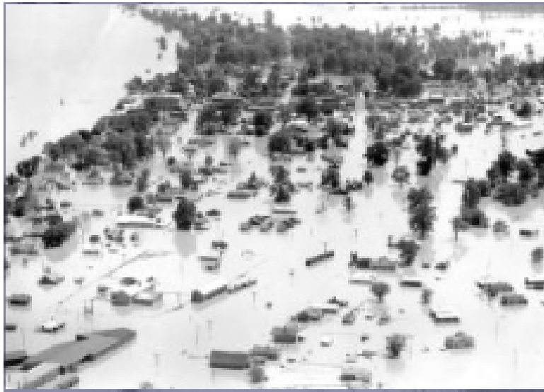
Lake Village: 1927 Flood