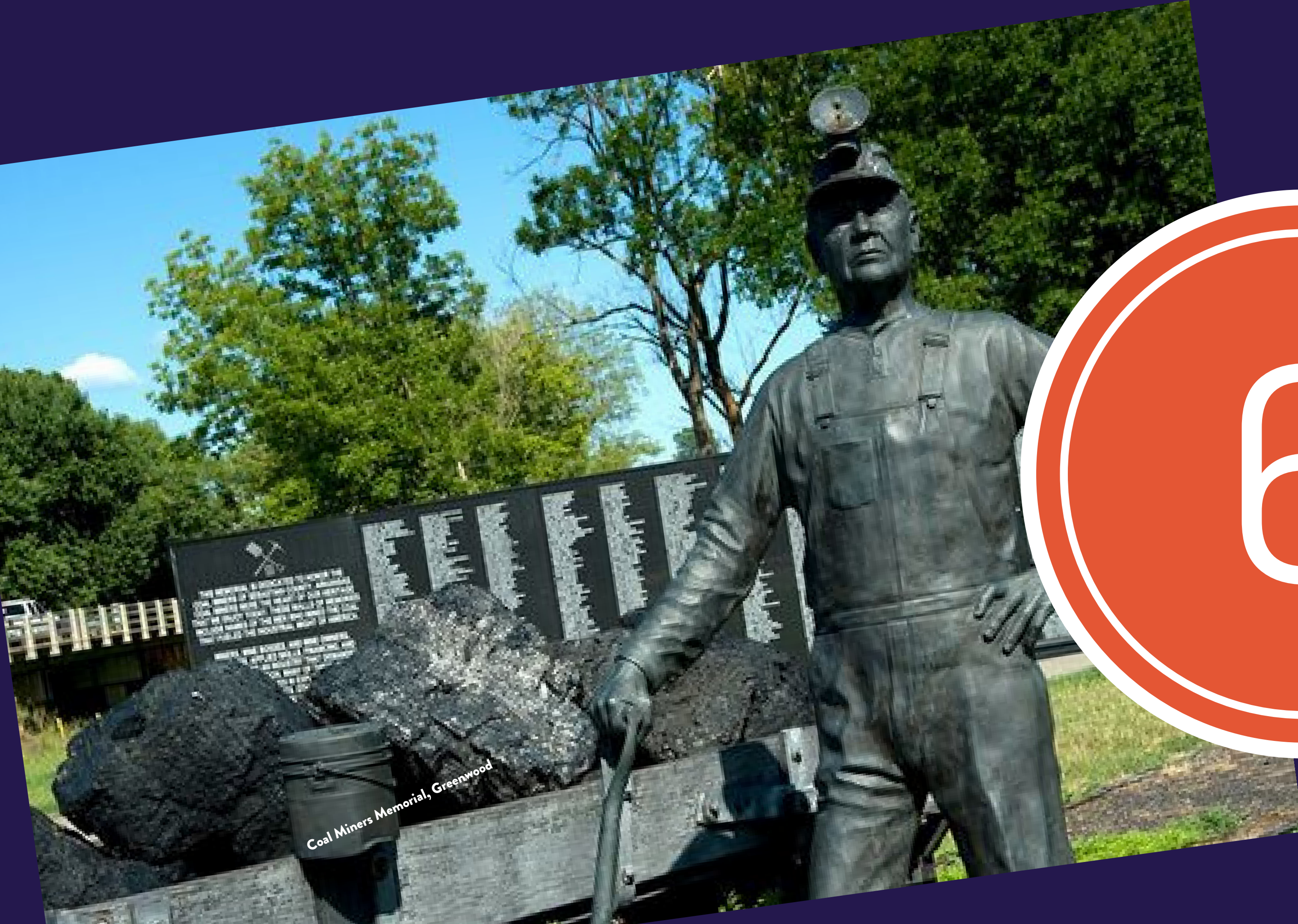
Coal Miners Memorial, Greenwood